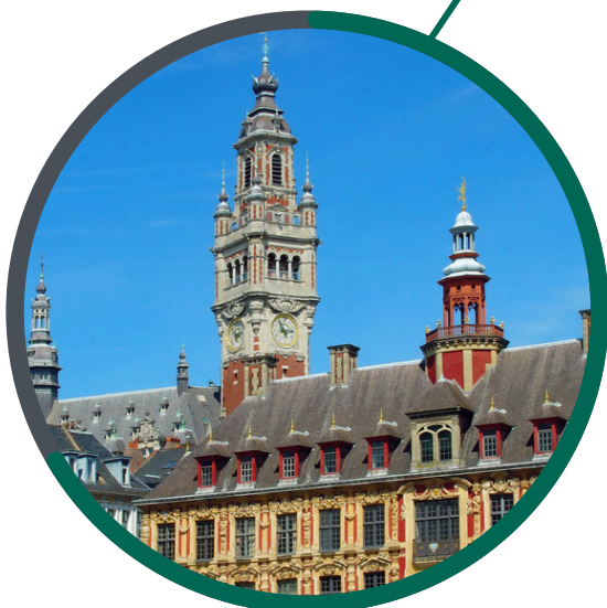
LILLE 30 MIN