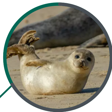
BAIE DE SOMME 2H